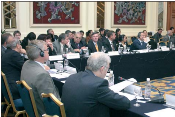
General Assembly of the Representatives

The business conference is in compliance with the fulfillment of the Viability plan of Kremikovtzi AD approved by the EU Commission and the Bulgarian government whose aim is the re-structuring and modernization of the company according to the EU standards.