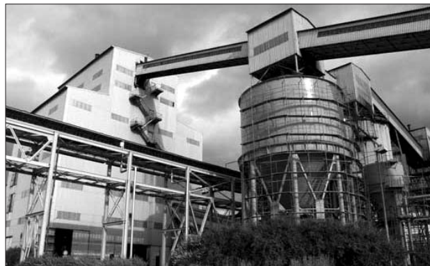
The aluminum plant "Aluminij d.d. Mostar".

Republic of Serbia. We should mention that the two entities in Bosnia and Herzegovina often act as two separate countries, which may, in the future, lead some historian, who is doing a research on this period, to a schizophrenic disorder. In the end of 2007, when the Austrian company Strabag, minority share-